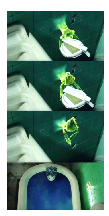
Figure 1 - A fictional example can be found in the movie Immortal (Ad Vitam): a bathroom appliance which, within its sphere of influence, supports users of the bathroom both by providing them with the objects they might need (in this case, toothpaste) for a given task and by providing them emotional feedback to their current state of mind