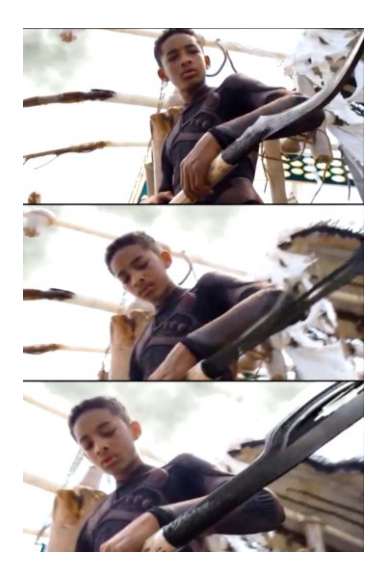
Figure 3 - In the movie After Earth, Kitai, the protagonist, finds a white rod in the wreckage of his space ship. Picking it up, Kitai demonstrates how multiple rods can extrude out of both its ends. much like the previously discussed relief style displays. However, instead of displaying information, these rods take on the form of various weapons or tools. The shape change here is used to represent information, rather, similar to a swiss army knife, the shape change allows the tool to take on multiple functions.

creating faux 3d reliefs. These displays are also prominent in SciFi narratives, as seen in the screenshots taken from X-Men (Figure 2).