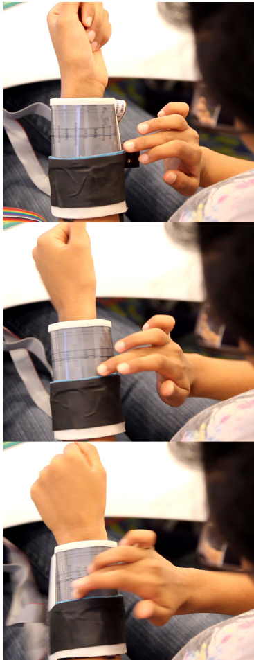
Figure 3: Bimanual swipe gesture

Bimanual swiping was generally used to enable faster scrolling (Figure 3). When participants were close to the target, but it was not immediately visible, they would rotate their wrist to bring it into view. In addition, participants also used the rotation of their left hand to correct for the actions of the right: to accommodate for the inertial scrolling, they commonly rotated their wrist to respond to an overshoot or in anticipation of an upcoming target.