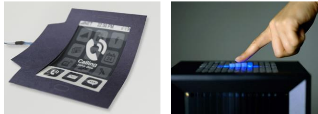
Figure 3 - MorePhone & Lumen

Current actuated display prototypes do not fully explore the tradeoff between shape and display resolution. Devices such as MorePhone [4] demonstrated a high resolution display, however a limited shape resolution. Lumen [9], on the other hand, presented a display surface with a relatively high shape resolution yet low display resolution (Figure 3). Both explorations, however, engage with the constraints provided by working with physical display and actuation technology. These constraints provide these devices with their unique look and feel.